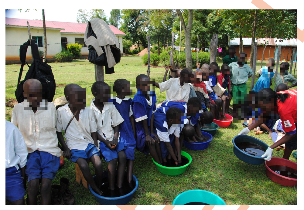
Fig 1. Jiggers removal program in school, with antiseptic soaking treatment.

https://doi.org/10.1371/journal.pntd.0011304.g001