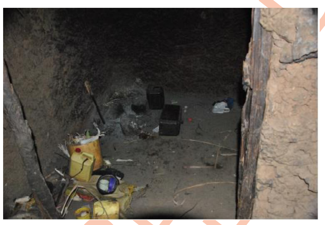
Fig 7. Sleeping room, where a family of 6 and their animals slept together. https://doi.org/10.1371/journal.pntd.0011304.g007

However, there appeared to be very little knowledge and much confusion about the topic of animals as carriers of the vermin. One infected woman explained: