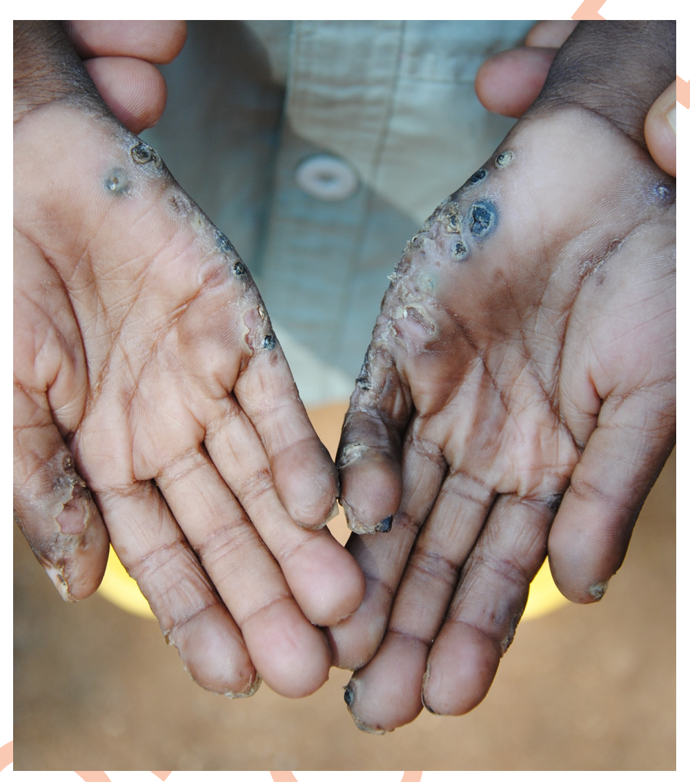
Fig 6. Pupil that had difficulties writing at school. https://doi.org/10.1371/journal.pntd.0011304.g006

Similarly, a Public Health Officer elaborated that: