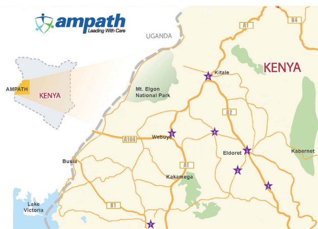
Figure 1 Clinical sites included in this study. Clinical sites from which healthcare workers (HCWs) were enrolled in this study (starred). (1) Moi Teaching and Referral Hospital (MTRH): Clinic modules 2–4, Rafiki Center of Excellence in Adolescent Health; (2) Mosoriot Rural Health Training Center; (3) Burnt Forest Sub-District Hospital; (4) Turbo Health Center; (5) Webuye District Hospital; (6) Kitale District Hospital; (7) Chulaimbo Sub-District Hospital.

Given that adolescents have developmentally specific challenges and require adolescent-friendly health services to meet their needs, it is critical to examine the specific impacts of the pandemic on HIV services and engagement for this group, as well as the HCW-level and clinic-level efforts to mitigate them. In this study, we examined the impacts of the COVID-19 pandemic on adolescent HIV service delivery and care engagement in western Kenya. We used in-depth qualitative inquiry with HCW regarding clinic-level and system-level changes, as well as broader economic and social impacts of the pandemic, to examine these intersecting challenges and the ways in which HCW endeavoured to sustain adolescent HIV care during this time.