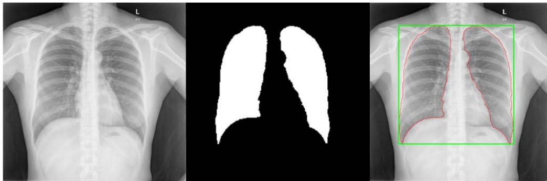
Figure 1. Lung ROI segmentation. a) Original image, b) Lung mask, c) Segmented ROI.

The performance of the customized CNN model relies on the architecture shown in Fig. 2. We propose a sequential, 12-layered CNN for the binary task of classifying normal and TB-positive CXRs. The individual datasets were randomly divided into 80% for training and 20% for testing. Within training, we performed 5-fold cross-validation to aid in optimal model selection. Images are down-sampled to 224×224 pixel resolutions. Each CNN block has a convolutional layer, followed by a batch normalization 30 and ReLU layer 16 .