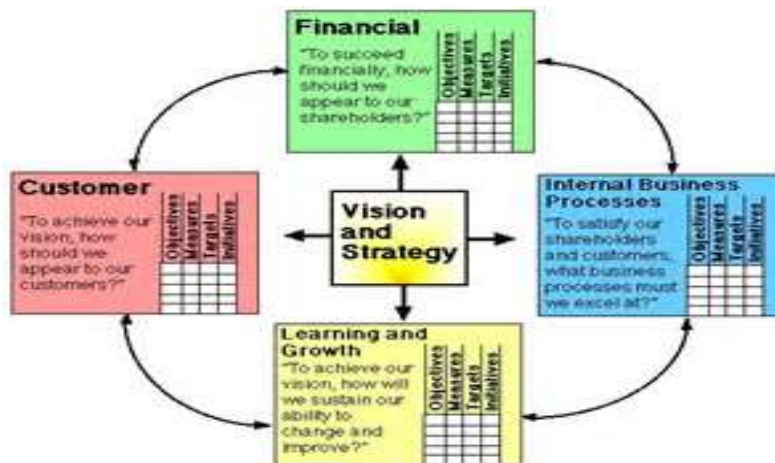
Figure: 2.1 The Balanced Scorecard

Adapted from Robert S. Kaplan and David P. Norton, "Using the Balanced Scorecard as a Strategic Management System," Harvard Business Review (January-February 1996): 76.