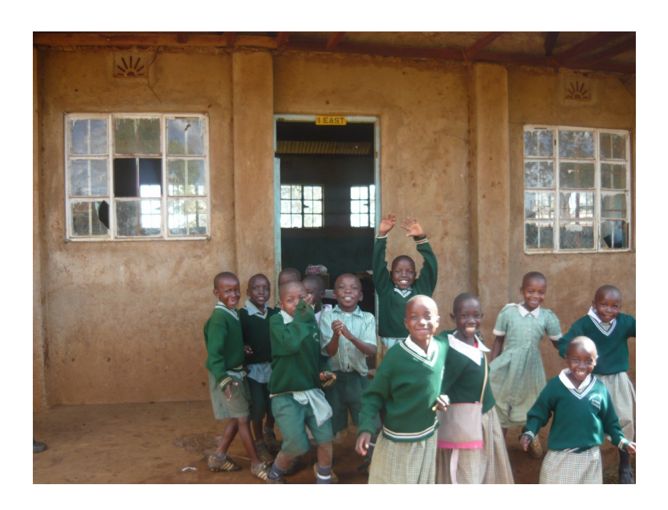
Fig. 5.4.2.3 Class One East Building

On the same compound there was a big contrast between the environment in primary section and ECDE section. The buildings in the primary section were permanent, classrooms were spacious, and the children were in full school uniform and looked cheerful as shown by the class one east in the figure 5.4.2.3