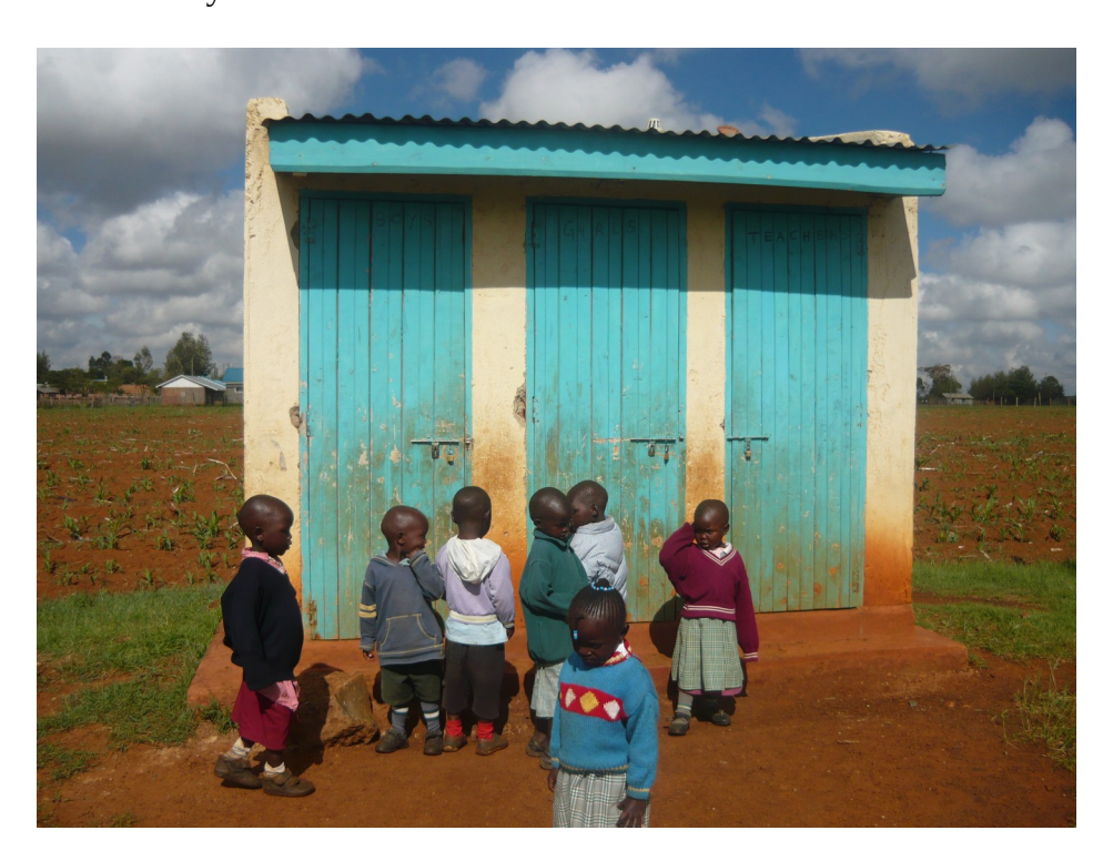
Fig. 5.4.2.4 A Toilet constructed through CSG

However, the researcher established through observation and interviews that amongst all the projects implemented, although inadequate, the construction of toilets was the single most successful project funded through the CSG. The Figure 5.2.4.4 shows an ECDE toilet funded through the grant. The ECDE toilet was a contrast of the ECDE building a few metres away.