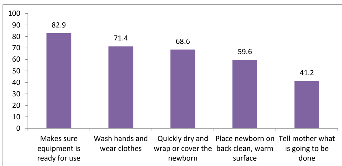
Fig 1: Preparation for Resuscitation.

Skills on Neonatal Resuscitation: The figure below illustrates the neonatal resuscitation skills.