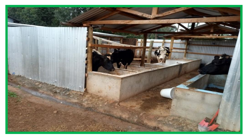
Plate 1. Zero Grazing Unit Showing Liquid Waste Drainage System in Kesses Uasin Gishu County