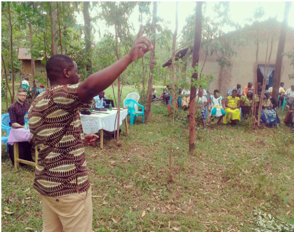
Figure 2. A health care worker giving a talk on sickle cell disease during a support group meeting in western Kenya.