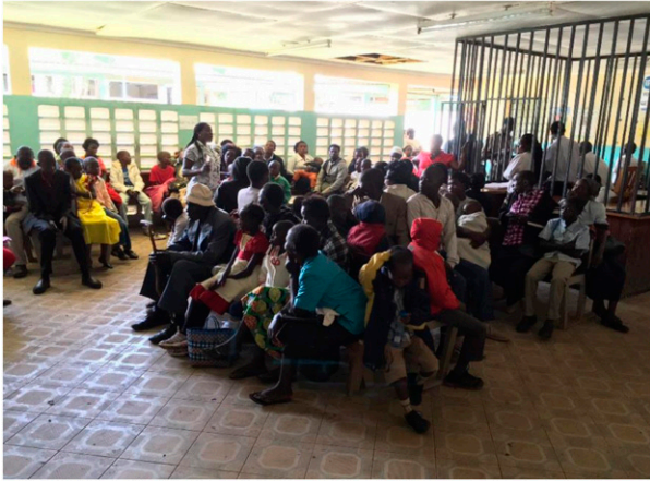
Figure 6. Patients attending the sickle cell clinic in Homabay County Referral Hospital.