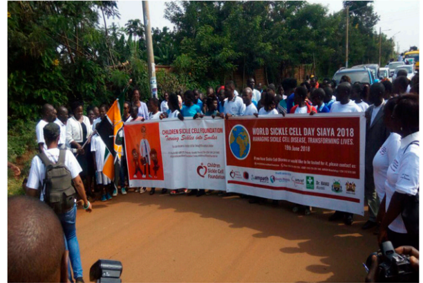
Figure 3. Advocacy efforts by patients and clinicians (2018: World Sickle Cell Day).