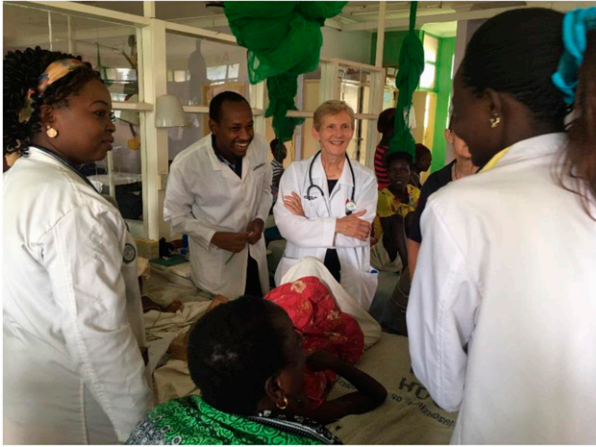
Figure 1. Training and mentorship of clinicians during a ward round at Busia County Referral Hospital in western Kenya.