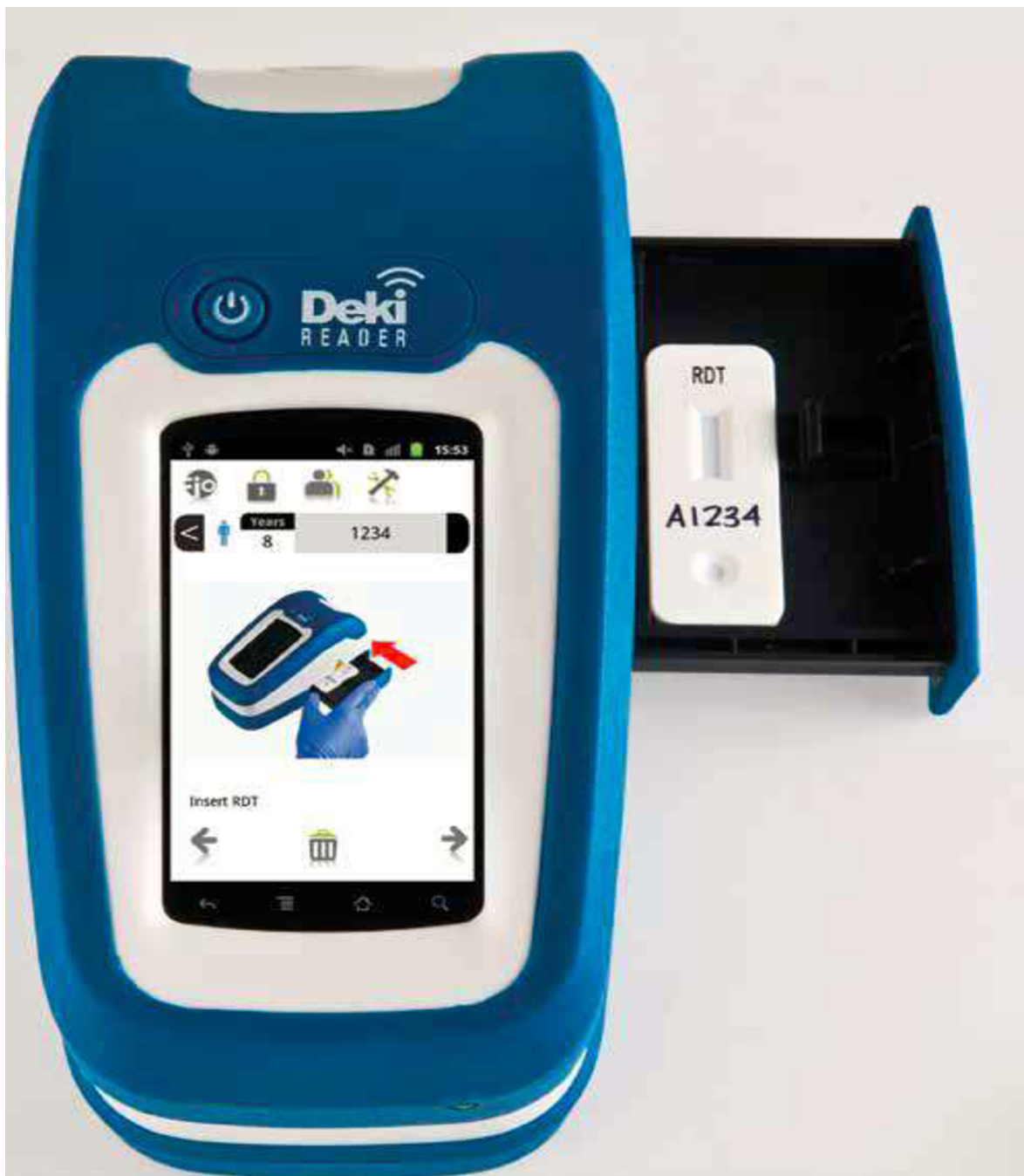
Fig 1. Deki Reader.

RDT procedure. The DR (Fig 1) then transmits all data, including a high-resolution image of the RDT to a cloud-based database in real time. In the secure portal, information from the field is displayed to show results in a custom dashboard of key performance indicators. The diagnostic performance of the DR has been proven to be comparable to visual interpretation [13, 14], with a sensitivity and specificity of 93.9% and 98.7% respectively for Plasmodium falciparum when compared to the gold standard [14]. We customized the device to allow the