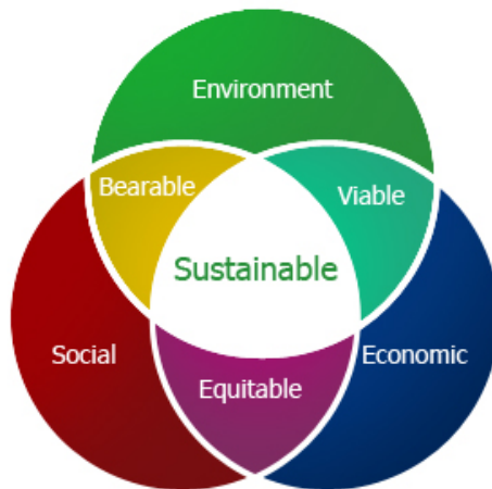
Fig. 1. Relationships in sustainable development – environmental, social and economic concerns.

SD is the development that meets the needs of the present generation, without compromising the ability of future generations to meet their own needs. The approach is based on the balance of different and sometimes competing needs in contrast with environment, social and economic limitations the society faces. Moreover, development is focused on specific needs without taking into consideration the environment and its impact in the future (Giddings et al. 2002). SD takes into consideration the relation between the environment and the balance of human needs, from the more basic to the most complex drivers that push us to make specific decisions that have a direct impact in the economy. In fact, if economic development is conducted with the depletion of natural resources, SD scope is to ensure strong, healthy and just society, meeting the diverse needs of all people in the present and in the future communities, by promoting wellbeing, social cohesion, inclusion and equal opportunity in the society (Figure 1).