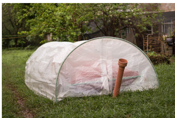
Fig. 3. Flexible biodigester plant

During my experience in Kenya, I came across a case study of a company operating in the country, producing innovative simple technology to promote the energy access in rural areas based on the employment of biomass from waste. The company invented and labelled an easy technology that could guide the substitution of wood-biomass employment with the reuse of food waste. The biogas system can also support the green economic growth, addressing the main challenges the country is handle such as unemployment, poverty, food insecurity, energy access.