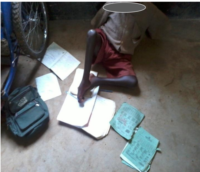
Fig2. a pupil with physical challenges using his toes to write

The researcher attended one lesson in one classroom which was randomly selected in each of the inclusive schools selected. In school A, it was revealed that the teachers gave special attention to pupils with physical disability who had problems when it came to writing and classroom participation. It was observed that the teacher dictated notes slowly to enable the pupils with limb problem to write at their own pace. There was a special case in the class attended where a pupil was using the toes for writing. This case is exemplified in Fig2.