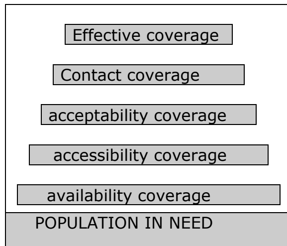
Diagram 1: Coverage pyramid

In order to study coverage five coverage measure were proposed and these were availability, accessibility, acceptability, adequate and effective coverage. The indicators used are shown in annex 1.