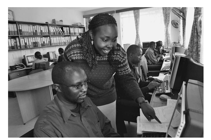
AU3 FIGURE 2. AMPATH data management staff.

from the US Centers for Disease Control, AMPATH is extending into primary care and reproductive health clinics its model of standardized encounter forms and electronic registration of patients. The focus initially is on tuberculosis, antenatal and maternal care, child health, and adult primary care in one urban site and a trio of rural ones. Here, AMPATH is partnering with clinicians, clinic managers, and record clerks to track patients, monitor their health information, and coordinate their care across multiple venues and specialties. Thus, each patient who presents at any clinic for care of any type is registered and given a universal identifying number on a laminated personal health card, which the patient keeps. This universal ID allows AMPATH to follow patients' care throughout the health care system. For example, a pregnant woman's medical records are linked from antenatal care, providerinitiated HIV testing, and counseling activities, maternity, and delivery. If the woman is HIV positive, providers in antenatal and HIV clinics can cooperate to ensure complete and timely care to prevent vertical HIV transmission to her infant. The records of mothers and their children can be linked and followed over time, even among care sites.