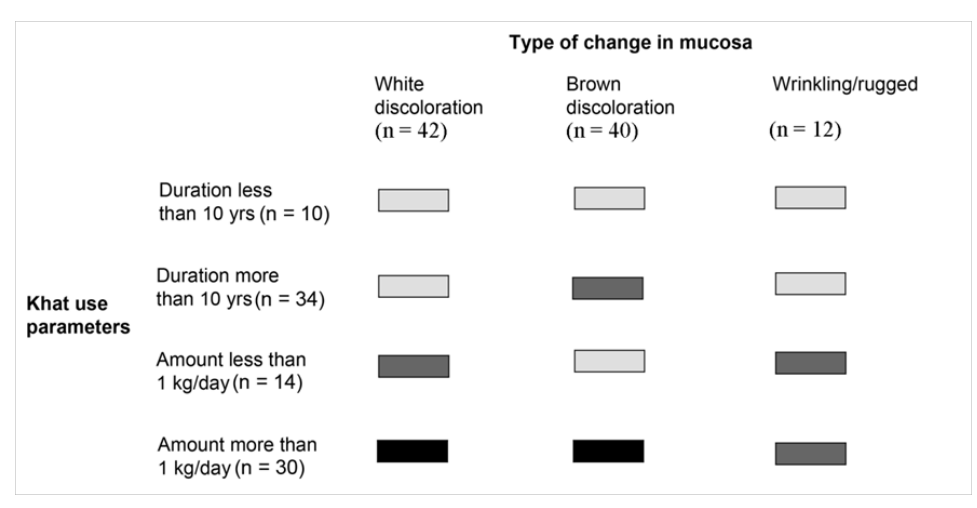
Figure 4. Variation in degree of white and brown discoloration as well as wrinkling with the duration and amount of khat use. The grade shown is the grade assigned to the majority of the participants in the specific group. (Light grey rectangles show mild changes, dark grey rectangles show moderate changes and black rectangles show severe changes)

plaque-like in texture. Twelve (27%) of them presented with lesions that were rough or wrinkled with rugged mucosa that appeared folded in some areas. Five of the non-smokers (36%) presented with wrinkling within the lesions whereas 7 of the smokers (23%) showed wrinkling within the lesions. Also, those using more than 1 kg of khat per day showed more wrinkled texture when compared to those using less than 1kg of khat per day. Severe forms of wrinkling were not noted even among heavy khat chewers, but the wrinkling was noted to be more pronounced among those using larger amounts of khat per day rather than the duration of khat use. These textural parameters were however not subjected to further analysis to determine the exact association because of the small sample sizes in each group.