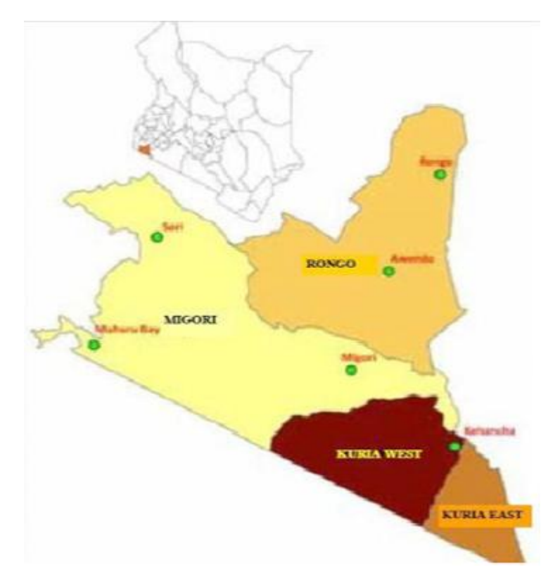
Figure 1: Map of Migori County

The study was carried out in Migori County which is in Nyanza Province of Kenya. It has a total population of 917,170 and covers an area of 2,597 km<sub>2</sub>. The presence of Lake Victoria, Migori and Kuria rivers and the relatively good weather patterns in Migori County have allowed the soils in the region to be well drained making the county a conducive environment for agriculture.