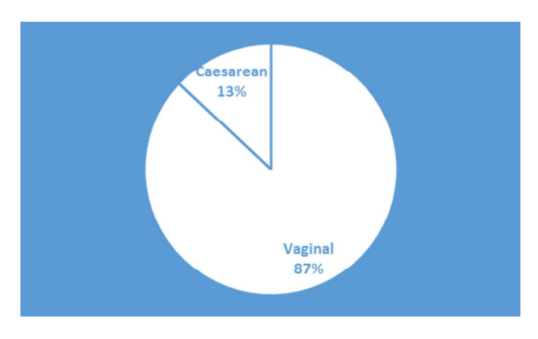
Figure 5. Mode of delivery

The figure below shows the eventual mode of delivery.