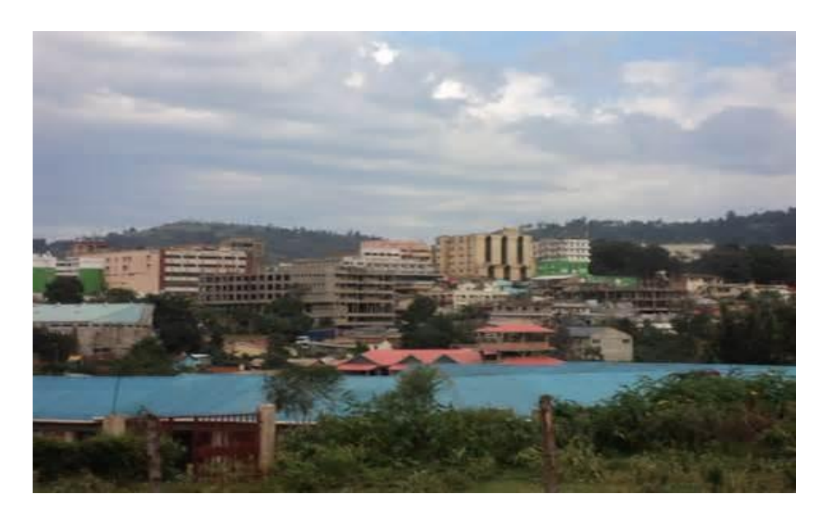
Plate 3.1: Picture of Kisii town

populations from across the countries with various racial and cultural backgrounds. The result of these diverse groups coalescing in one organization and the high turnover rate of employees makes it a prime environment to study interpersonal conflict.