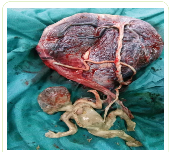
Figure 2 Placenta of monochorionic monoamniotic twin pregnancy with macerated early second trimester single intrauterine demise, velamentous cord insertion.