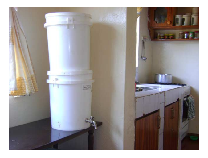
Figure 3 | Hom device for rendering water potable in use in a household.

To assess the public acceptance potential of the Hom device for rendering water potable, preliminary surveys were conducted in three convenient public exhibitions. In each exhibition venue two complete device units were displayed on a stand. The first venue considered was a three-day annual exhibition organized by the Commission for Higher Education (CHE) for Kenyan Universities held on 15-18March 2006 in Nairobi. At a frequency of every 10-15 min, a visitor to the stand, regardless of gender, was invited to fill in a one page response sheet after being fully informed about the nature and functioning of the device