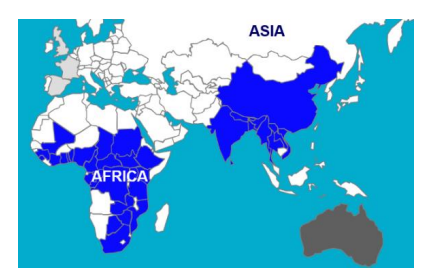
Figure 2 Geographical distribution of C. anisata (in blue) based on Table 1 and other reports. C. anisata, Clausena anisata (Willd.) Hook f. ex Benth.