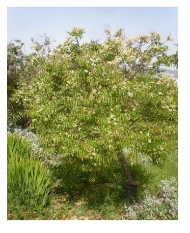
Figure 1 Clausena anisata tree.

The leaves (branches/aerial parts) and stem bark are the most used parts for preparing herbal remedies. Phytochemical, pharmacological, and toxicity studies have primarily investigated these aspects. This is