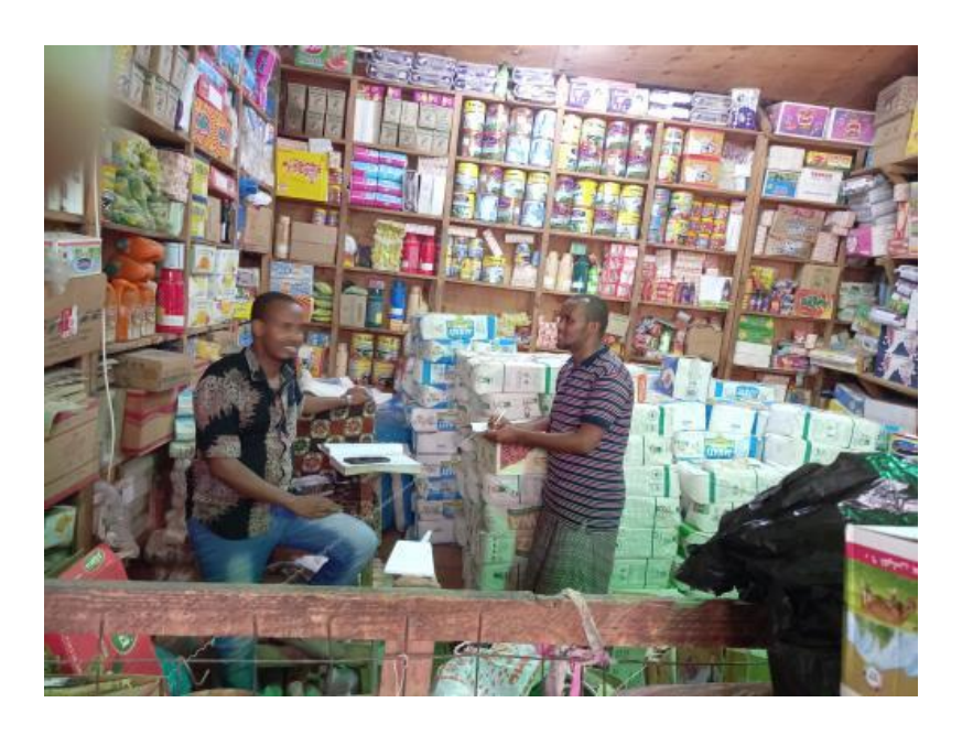
Plate X: interview session with one of the local community traders

Picture taken on 13<sup>th</sup>January 2021 showing the researcher interviewing one of the host traders on the outskirts of IFO camp inside the trader's shop