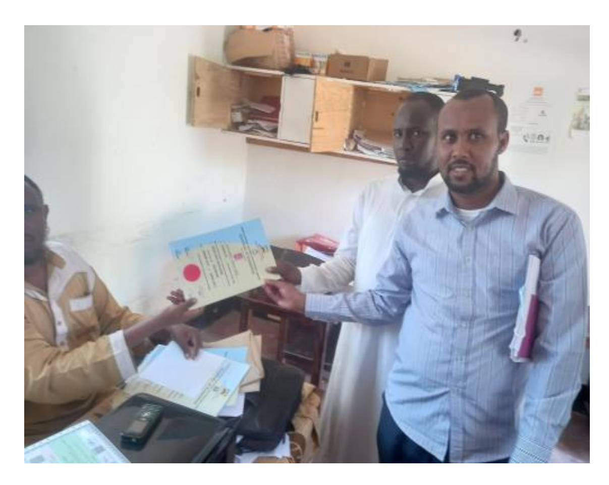
Plate XII: After interviewing the Principal of YEP

Picture taken on 8^{th} January 2021 showing researcher after an interview with the principal, YEP in Dadaab town.