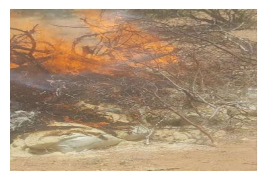
Plate VI: Destruction of Smuggled Goods

Plate V shows officials of local administration, police, and national government preparing to destroy a consignment of illegal sugar imported from neighbouring country. Plate VI shows the burning of contraband sugar. This photo was taken by the researcher on 20<sup>th</sup> December 2020 in Dadaab.