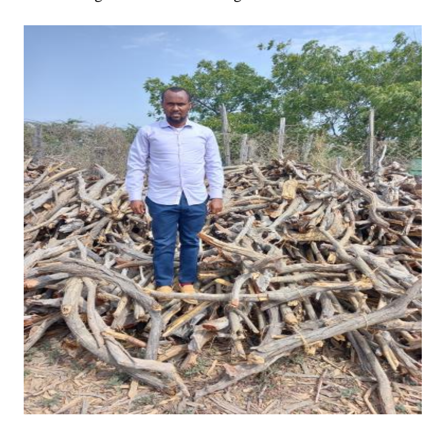
Plate II: Evidence of environmental destruction

Destruction of national habitat also takes a similar cause to that of environmental degradation. The picture below is evidence of the way trees are felled to get firewood or use by hosts and refugees in the Dadaab region.