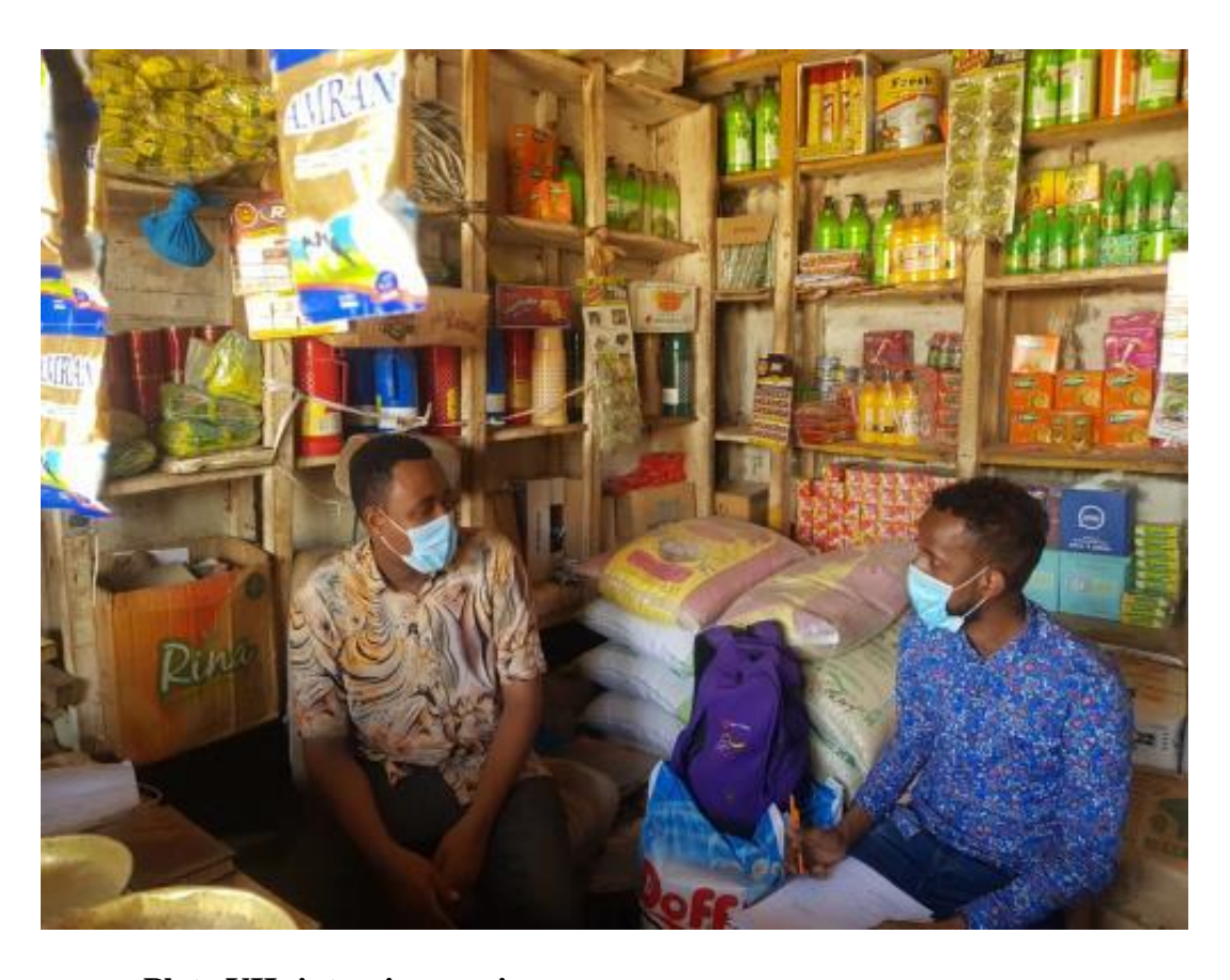
Plate VII: interview session

Picture taken on 13<sup>th</sup> December 2020 showing one of the research assistants interviewing a trader in Dadaab host community near IFO camp.