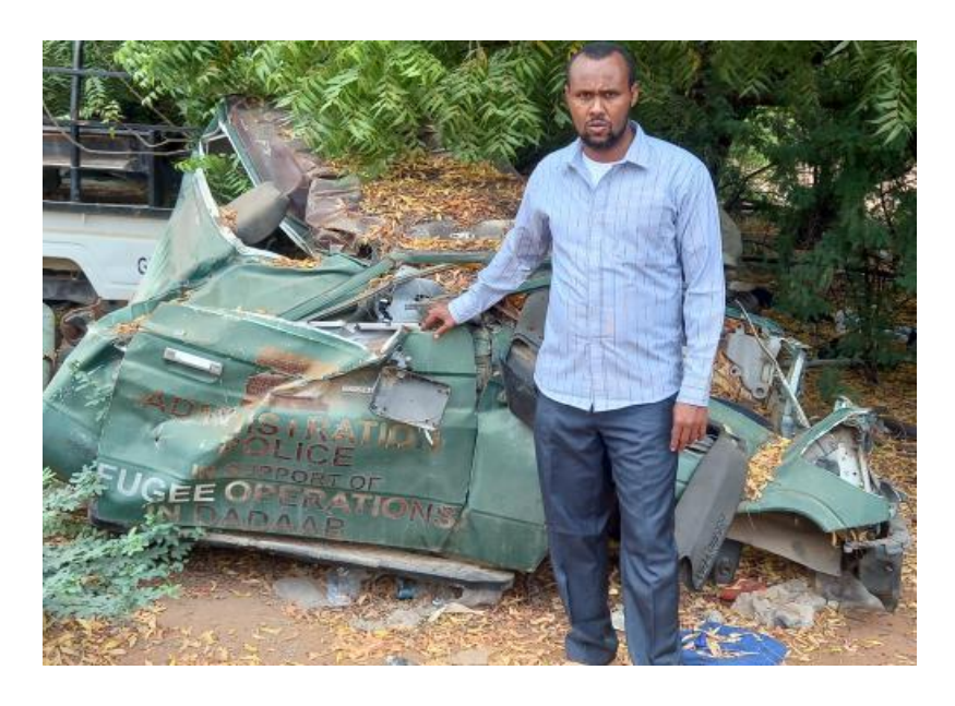
Plate III: Shell of a police vehicle destroyed by Improvised Electronic Devices

camps by improvised explosive devices (IEDs) are nine since 2011 to 2020 with hundreds of Police officers losing their lives (see samples in Plate III and IV)