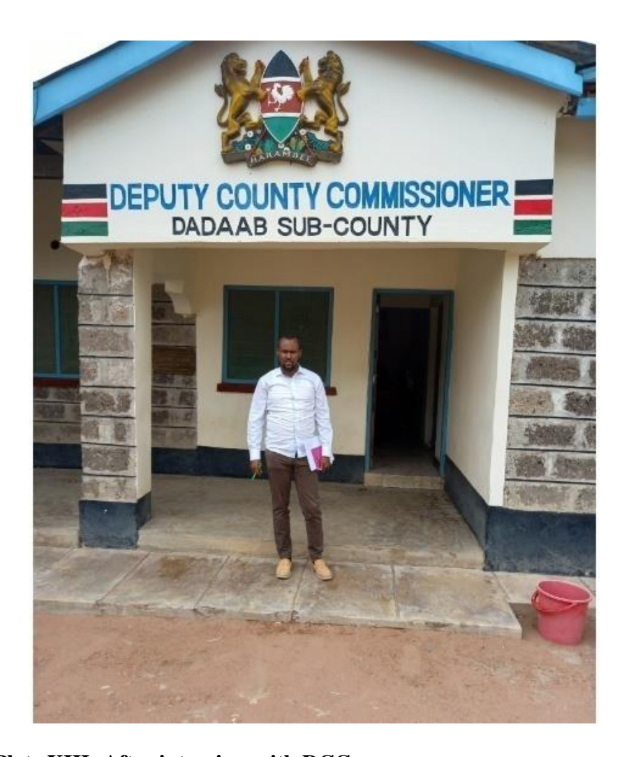
Plate XIII: After interview with DCC

Picture taken on 5<sup>th</sup>January 2021 showing the researcher after an interview with the deputy county commissioner at the officer's office in Dadaab town.