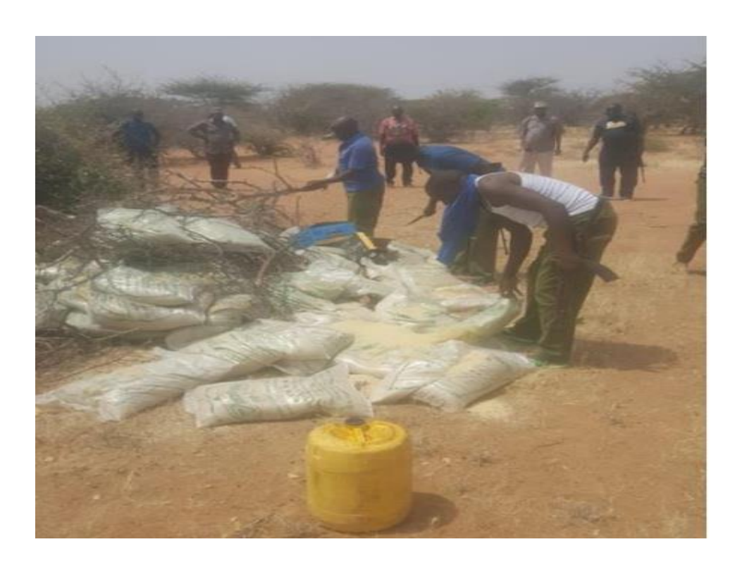
Plate V: Preparation for destroying smuggled goods