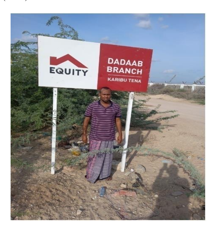
Plate XI: Researcher outside Equity Bank Dadaab after an interview

Picture taken on 13<sup>th</sup>January 2021 after an interview with the manager of Equity bank, Dadaab branch. Source: Author (2021).