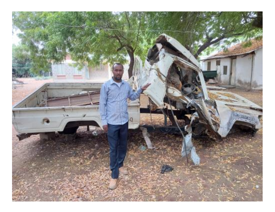
Plate IV: Shell of a police truck destroyed by an improvised bomb

Plate III and IV show the shells of patrol vehicles that were bombed by IEDs. These soft body vehicles cannot withstand the explosives. This photo was taken on 16<sup>th</sup> December 2020 by the researcher at the Administration police offices in Garissa. The photos were taken while the researcher was on data collection mission.