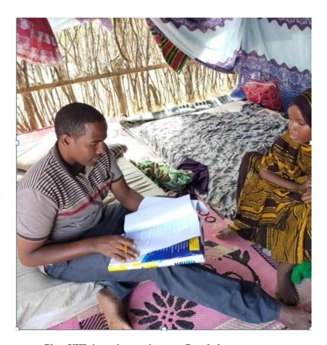
Plate VIII: interview session near Dagahaley camp

Picture shows a research assistant helping one of the host community respondents to address the study questionnaire. Picture taken outside Dagaahaley refugee camp on 10^{th} December 2020.