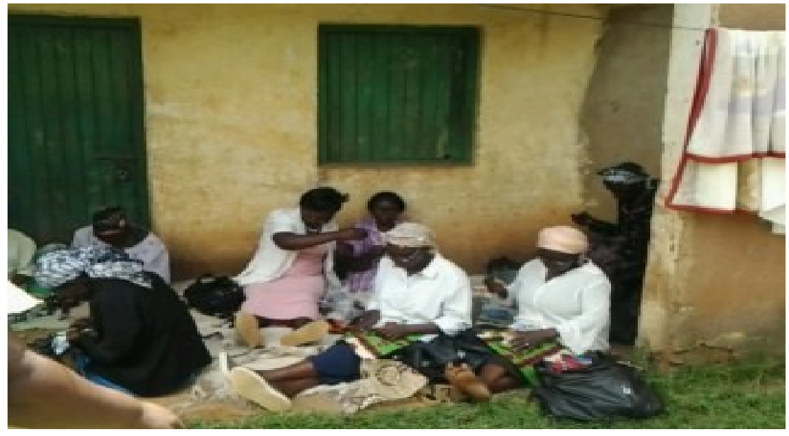
Levels of Education of participants and access to WEF

The findings from this study found out that women with no formal education and those who never learnt beyond primary level were more into the fund than the more educated ones as shown in table 4.3