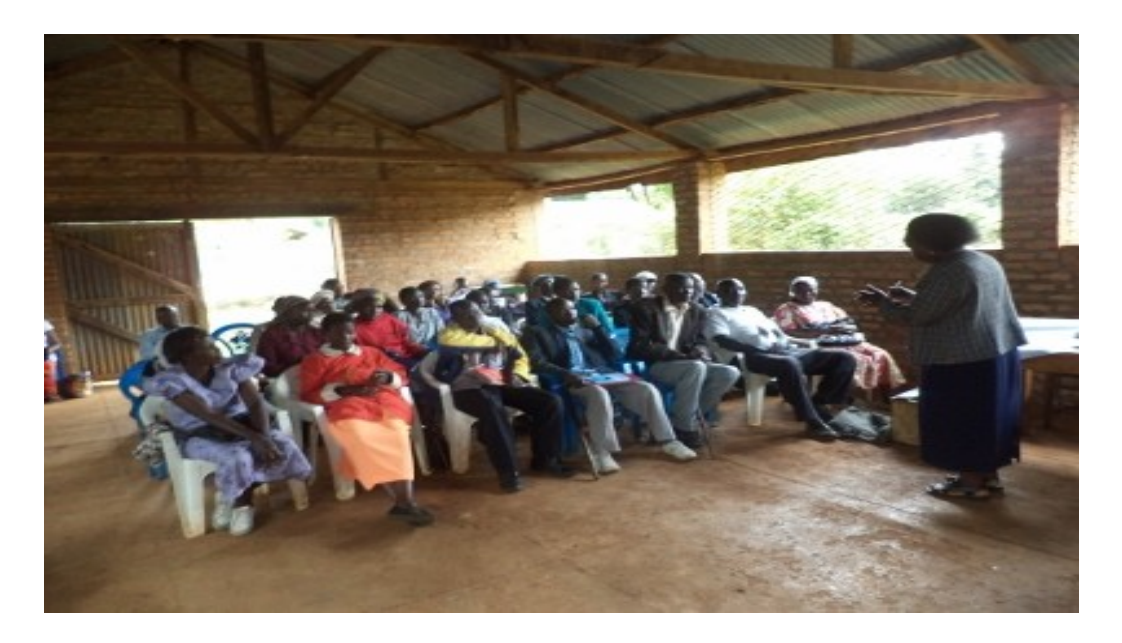
Figure 4.5 A training for buchevo CBO support group in Kabula on income generating activities before group gets funds from WEF. (22/6/12)