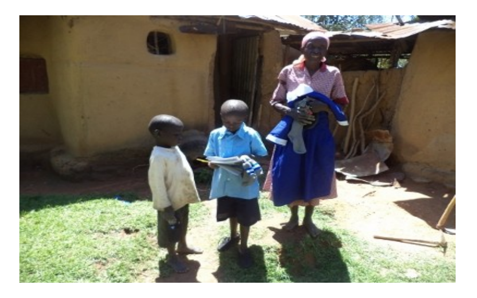
Figure 4.6 Poverty in rural areas of Kenya, a woman receives uniform for her children from an existing a women group in Sangalo village

recommend a similar research with a bigger sample size over a longer duration to be conducted.