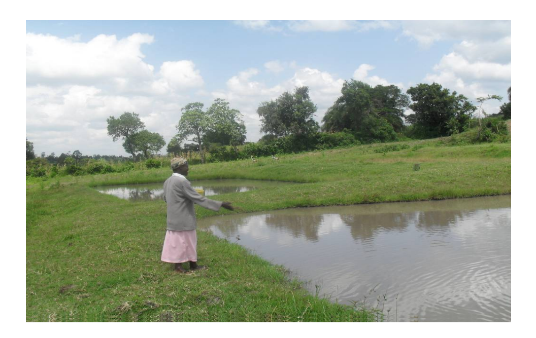
Figure 4.2 A photo of a member of Yulusi Young Women's Group in Milo feeding fish in a group's fish pond- 13<sup>th</sup> July 2012) -

experienced the problem that more than half of the women are fronted as clients by male relatives who upon credit extension appropriate the loan for their own purposes while the formal client remains responsible for interest payments and loan recovery without actually having the loan capital available. Nobody really knows the extent of such greedy practices on a global scale but there is growing evidence that it happens more often than MFIs may report or even know.