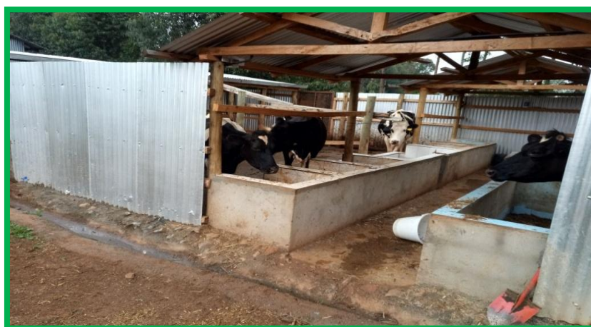
Plate 1. Zero Grazing Unit Showing Liquid Waste Drainage System in Kesses Uasin Gishu County