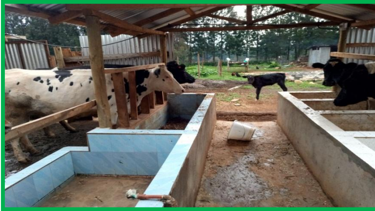
Plate 2. Zero Grazing Unit Showing Water and Food Troughs in Uasin Gishu County