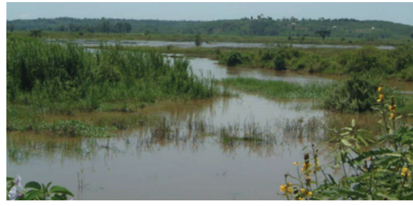
Photography 2: Flooding in the upper part of the swamp.

Although cultivation of vegetables, tubers and fruits is common livelihood strategy among the local community, the dispute between the company and the community members changed this activity from a source of economic income to a resistance tool. Planting banana trees, local vegetables or cabbages near the river was initiated to block the company from expanding