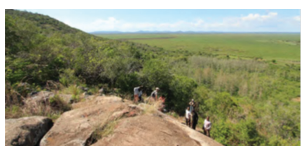
Photography 1: View of Yala Swamp.

Although participation has become a critical component of development projects, especially in rural communities and also in projects with displacement component, this study reveals that community members and project managers have different and sometimes incongruent perceptions and objectives. According to project managers and government officials, participation