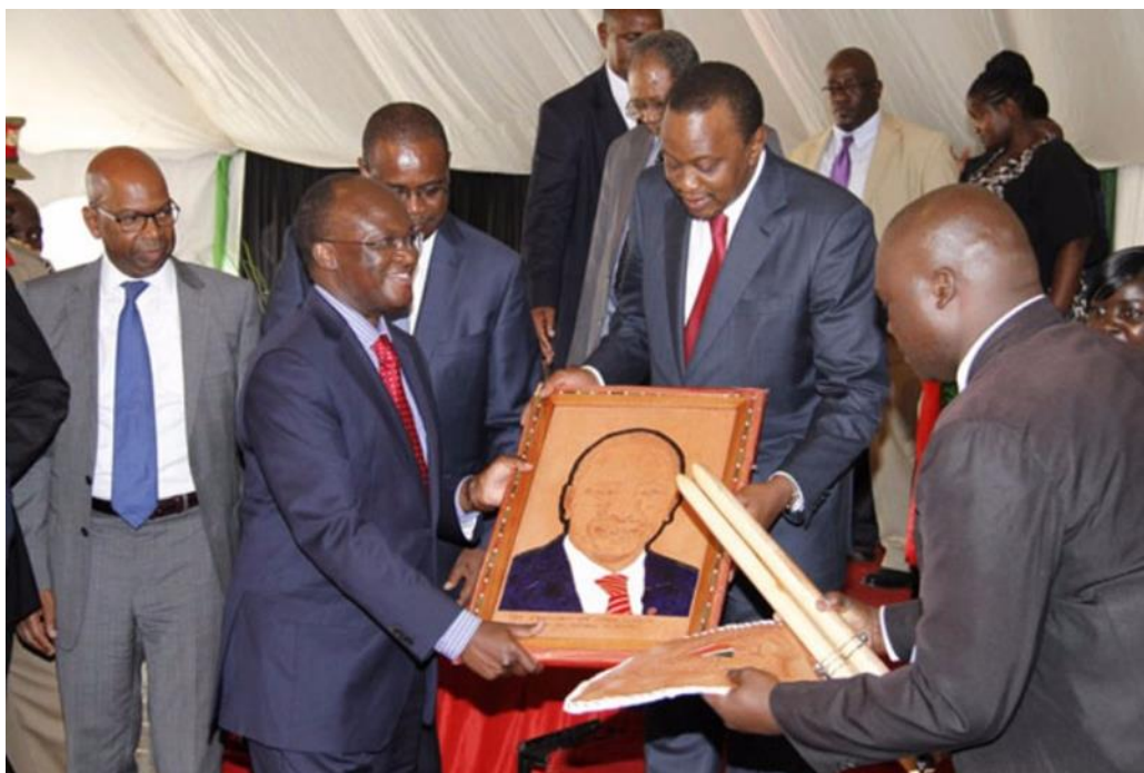
(Photo caption) President Uhuru Kenyatta receives a gift of an art work done by Mathari patients on February 18, 2015.

from different types of mental illnesses as ‘mentally ill’. One document had the title: Abandoned and neglected, Kenya’s mentally ill suffer in bitter silence and the same document had the below image where the sick were described as ‘Mathari Patients’ as shown here below: