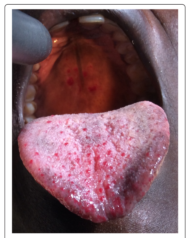
Fig. 1 Telangiectasias on the tongue and hard palate. A photograph of the patient's oral cavity showing multiple, guttate-like, erythematous lesions with a tendency to coalesce on the edges of the tongue, as well as a few grouped erythematous, well-demarcated lesions on the hard palate. The lesions were nontender and blanched upon pressure

Her cardiovascular examination was notable for mild tachycardia, a bounding pulse, and a hemic murmur. She had hepatomegaly of 7 cm below the costal margin