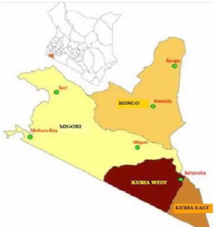
Figure 1: Map of Migori County

The study was carried out in Migori County which is in Nyanza Province of Kenya. It has a total population of 917,170 and covers an area of 2,597 km 2 . The presence of Lake Victoria, Migori and Kuria rivers and the relatively good weather patterns in Migori County have allowed the soils in the region to be well drained making the county a conducive environment for agriculture.