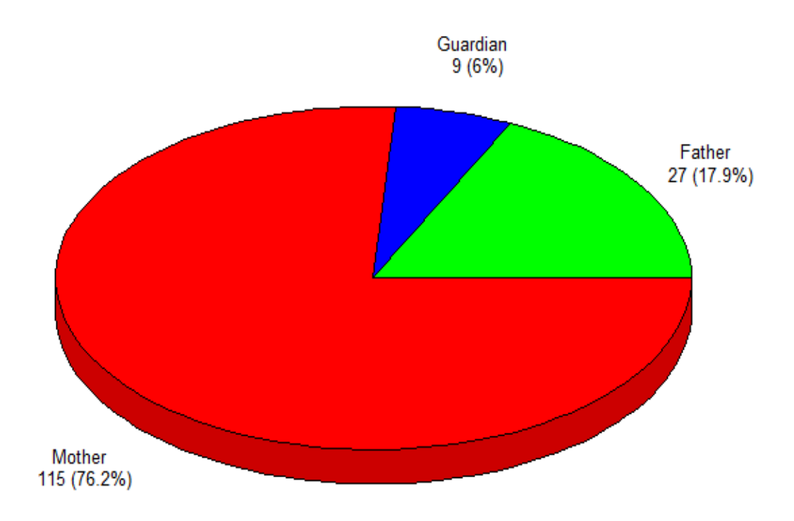
Figure 1: Caretaker Distribution

A total of 151 participants were analyzed. The median (IQR) age of the participants was 5.0 (IQR: 3.0, 8.0) years with a minimum and a maximum of 1.0 and 18.0 years respectively (Figure 1). Majority of the participants were aged between 2.5 and 7.5 years.