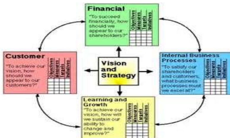
Figure: 2.1 The Balanced Scorecard

Adapted from Robert S. Kaplan and David P. Norton, "Using the Balanced Scorecard as a Strategic Management System," Harvard Business Review (January-February 1996): 76.