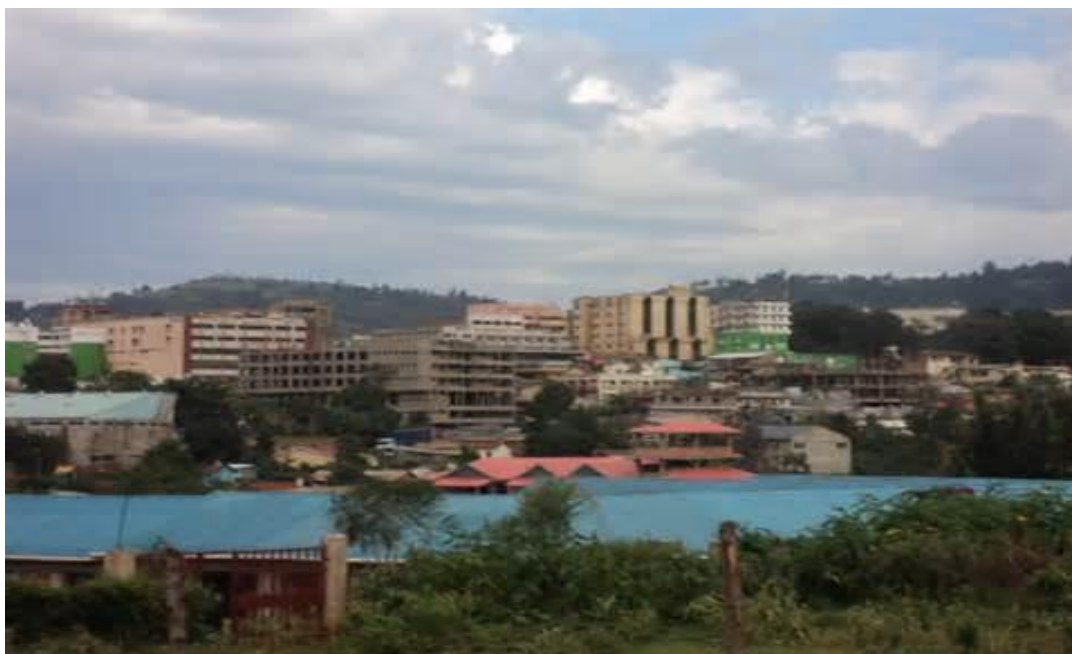
Plate 3.1: Picture of Kisii town

populations from across the countries with various racial and cultural backgrounds. The result of these diverse groups coalescing in one organization and the high turnover rate of employees makes it a prime environment to study interpersonal conflict.